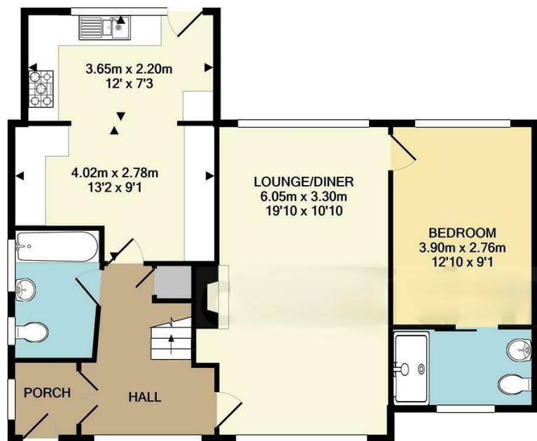
GROUND FLOOR APPROX. FLOOR AREA 71.8 SQ.M. (773 SQ.FT.)

206 South Coast Road, Peacehaven, East Sussex, BN10 8JP 01273 830 987 bnsales@localagent.co.uk